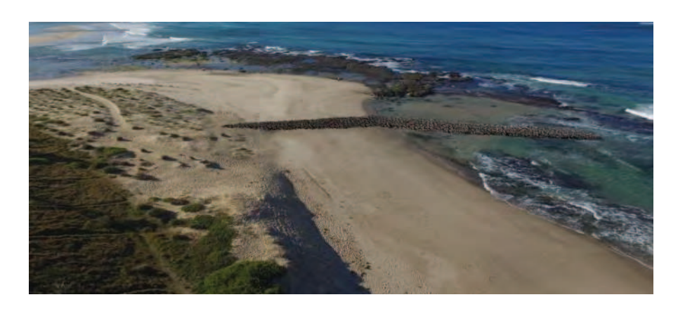
Artist's impression of the proposed rock groyne

In the 2015/16 Budget, the NSW Government allocated $2.4 million to construct a rock groyne on South Entrance Beach, located just to the south of the Surf Life Saving Club tower.